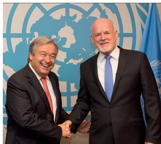
→ United Nations Secretary-General António Guterres has appointed Peter Thomson of Fiji as his Special Envoy for the Ocean

Special Envoy for the Ocean of the UN Secretary General 13 September 2017