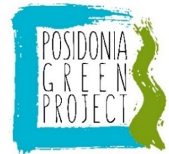
Posidonia Green Project