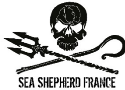
Sea Shepherd France