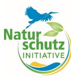
NATURSCHUTZINITIATIVE eV (NI)