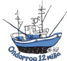
Ondarroa 12 Milia